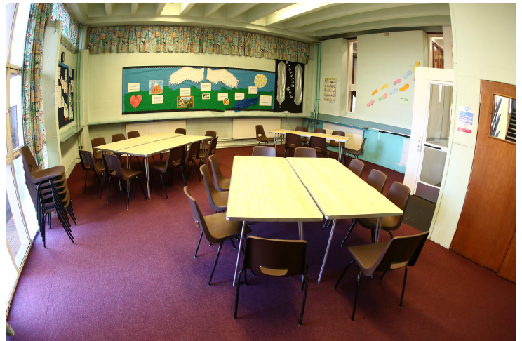
LOWER DECK BEFORE