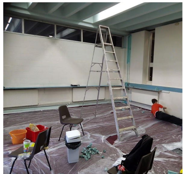
LOWER DECK DAY 2